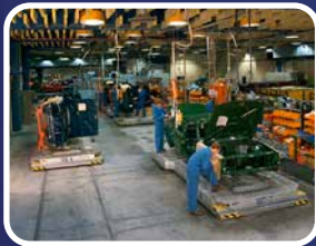
World's first automobile production plant with driverless vehicles, Volvo, Sweden, 1972.

With an installed base of more than 30,000 vehicles, Kollmorgen is the number one provider of vehicle automation kits.