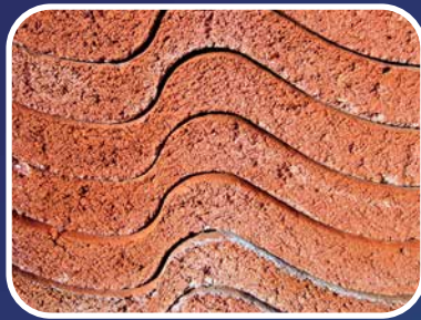
Ceramics & Tiles