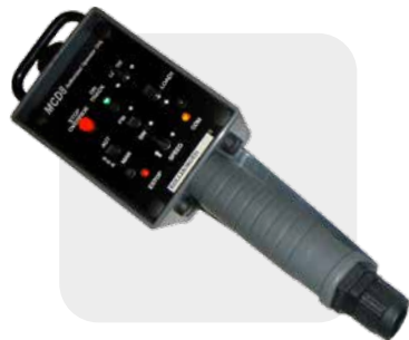
Manual control device