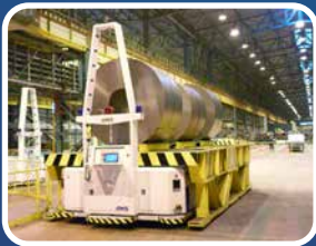
World's first driverless vehicle with 16 controlled wheels, Posco Steel, South Korea, 2009.