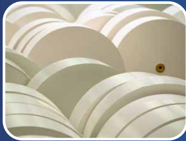
Paper & Printing