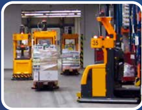
World's first Pick-n-Go system, Marktkauf, Germany, 2007.