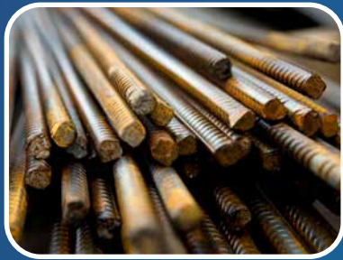
Steel & Heavy Goods