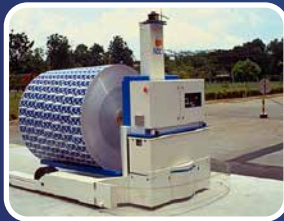
World's first laser-guided vehicle, Tetra Pak, Singapore, 1990.