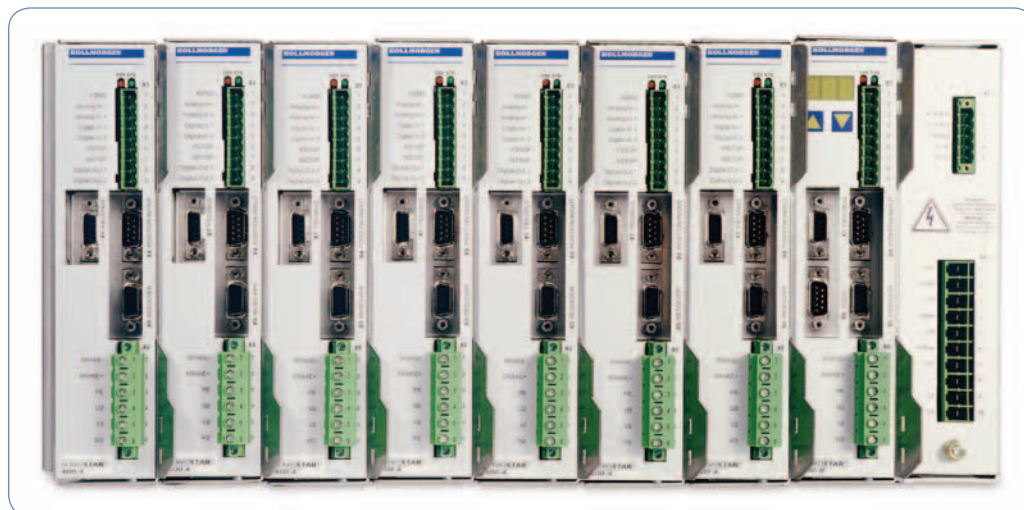
8 Axis SERVOSTAR® 400