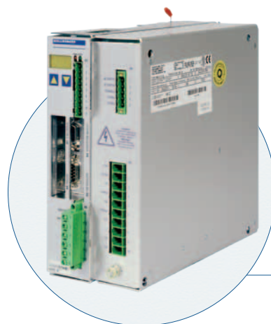
SERVOSTAR® 400 M